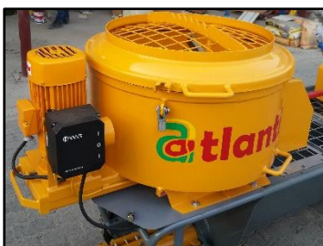
Twin Pan Mixers