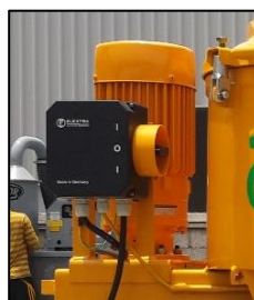
Cam Shaft Controller